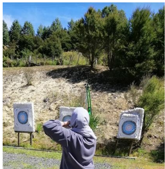
Another with great form – Bullseye!