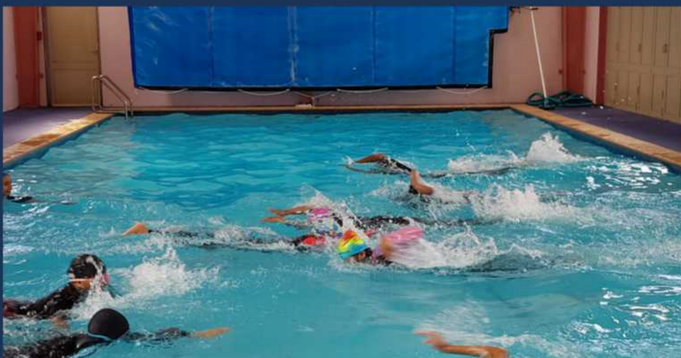
OUR OWN SWIMMING POOL