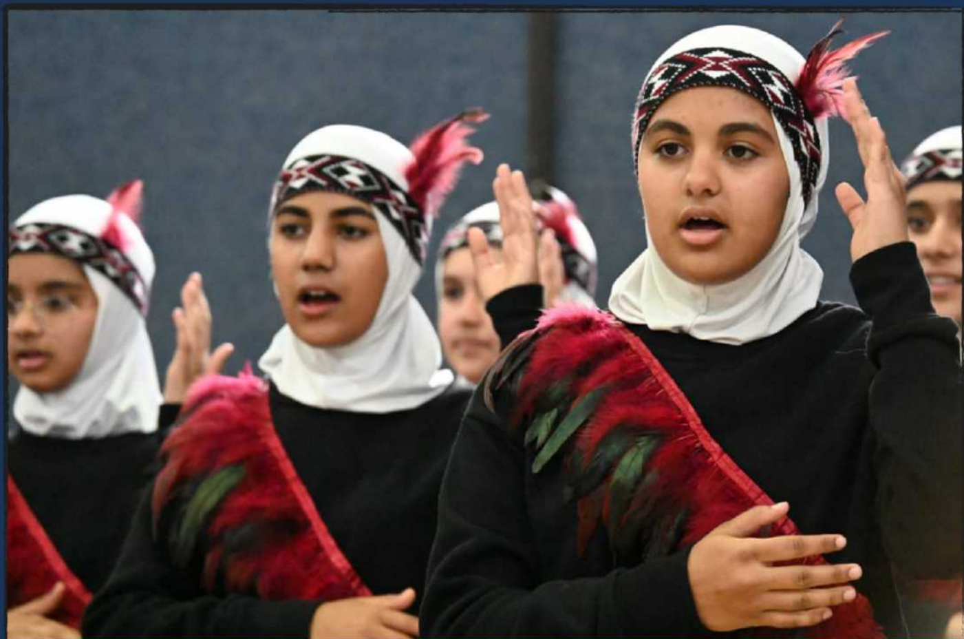
WEAVING CONNECTIONS THROUGH TAHA MAORI