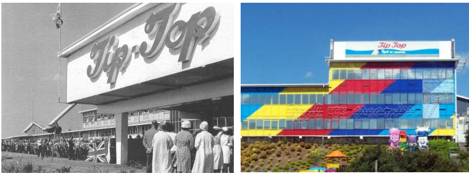
Tip Top opens in Mt Wellington 1962 and as seen today

They learnt about the variety of products, the history of the factory and the processes involved in making ice cream. They also enjoyed an ice cream of their choice.