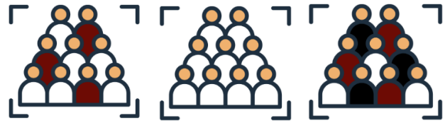
Photo Day – Tuesday 11 March

We appreciate the cooperation of our school community in helping keep our students safe while these essential upgrades take place in our neighbourhood.